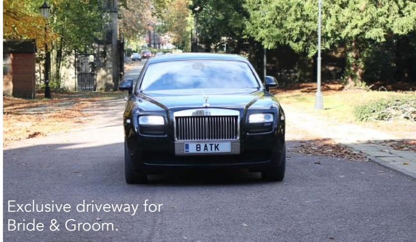
Exclusive driveway for Bride & Groom.