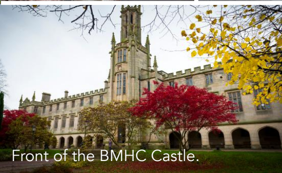
Front of the BMHC Castle.